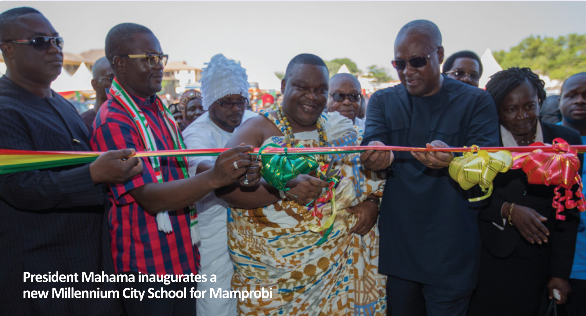
President Mahama inaugurates a new Millennium City School for Mamprobi