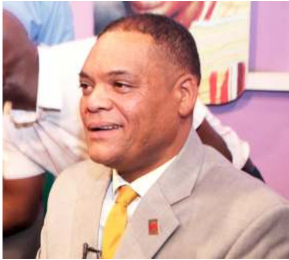
IVOR KOBINA GREENSTREET

(Presidential candidate of the Convention People's Party (CPP))