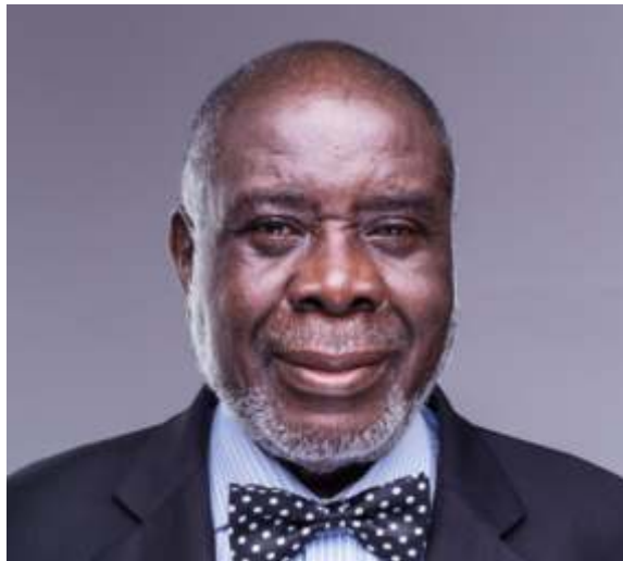
NANA GABBYS NKETIAH

(Presidential candidate of the Convention People's Party (CPP))